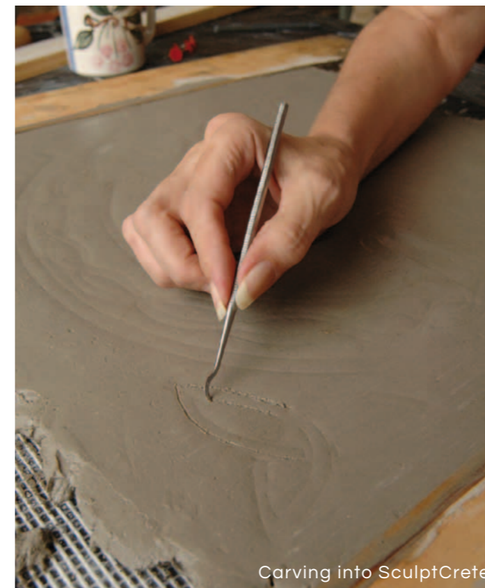
Carving into SculptCrete