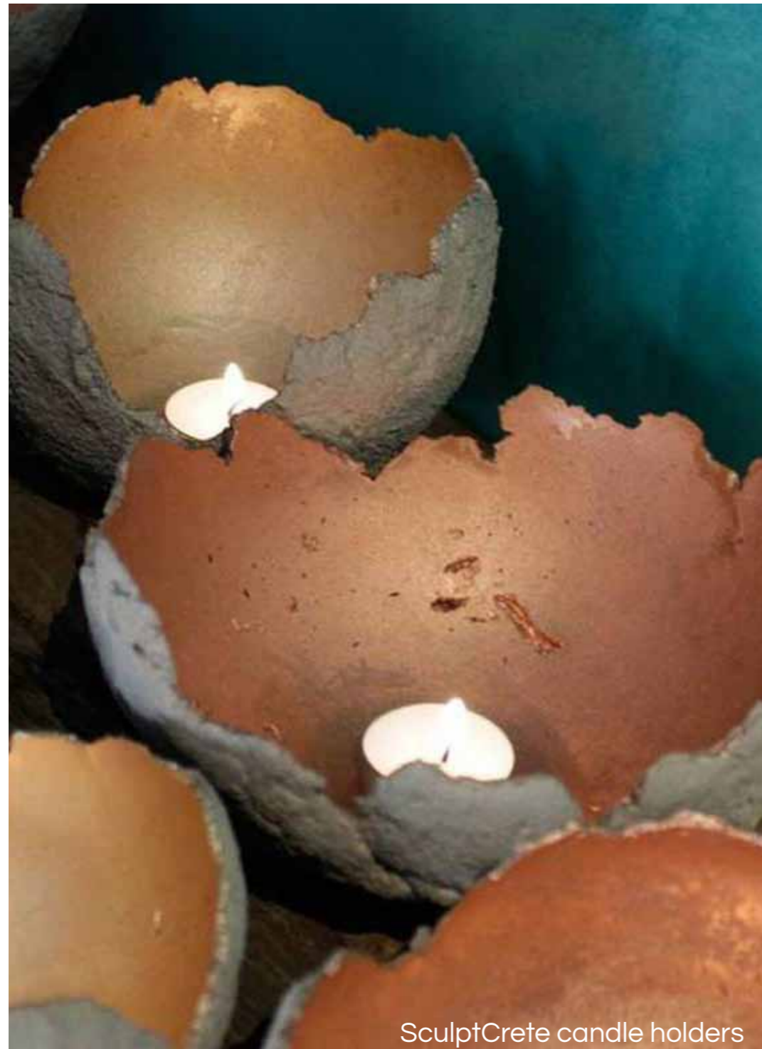
SculptCrete candle holders

SCULPTCRETE | PRODUCT INFORMATION & BENEFITS