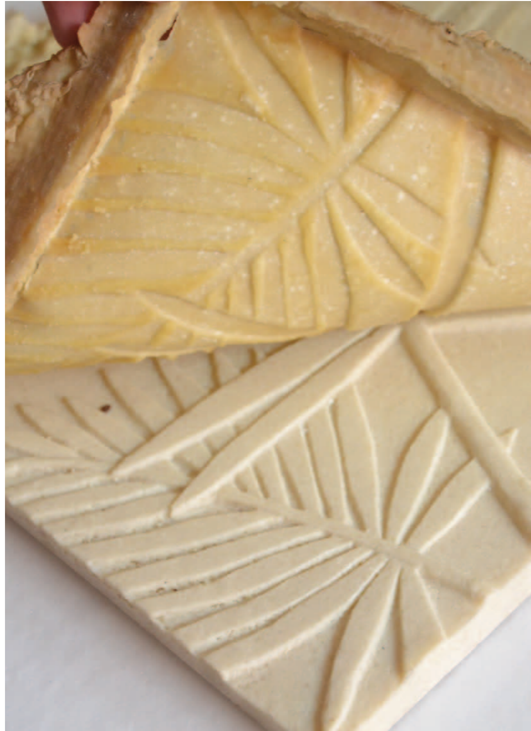
A synthetic latex rubber for detailed reproduction of objects of virtually any fine texture.