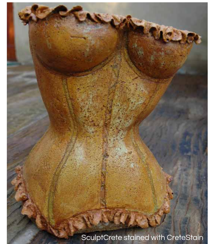
SculptCrete stained with CreteStain