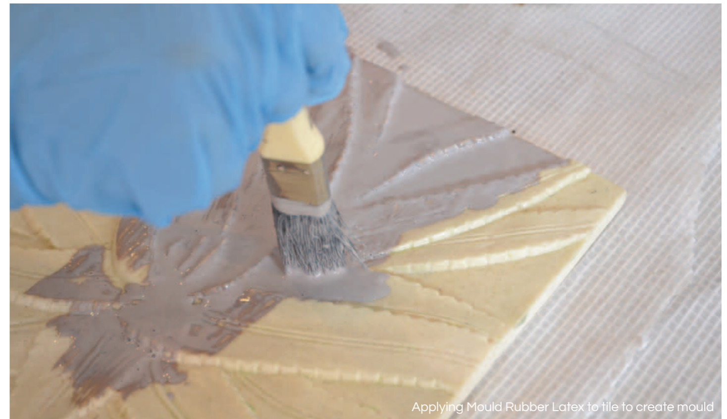
Applying Mould Rubber Latex to tile to create mould