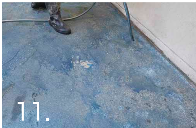
11. Although the retarder is blue in colour, a second person can assist the person spraying, ensuring the whole floor is sprayed evenly so as to obtain an even aggregate exposure. The retarder must be shaken before use and frequently agitated during use. Spraying is preferably done using an airless spray gun with a medium tip nozzle between 1.2mm and 2.5mm. The wet Exposed Aggregate must have no bleed water on it prior to the application of the retarder. Leave the floor covered with plastic for at least 2 days in summer and 3 to 4 days in winter. In cold weather this may take longer.