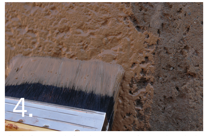
Allow the first coat to dry for 24 hours. Mist spray first twice during the day following the day of application. Once the first coat has dried, apply the second coat mixed with clean water only. Use a large paintbrush (NOT a lime wash brush or roller). Mist spray the second coat twice during the day following the day of application and allow to cure for 24 hours. It is recommended for darker colours that the final coat be cured for at least 4 days.