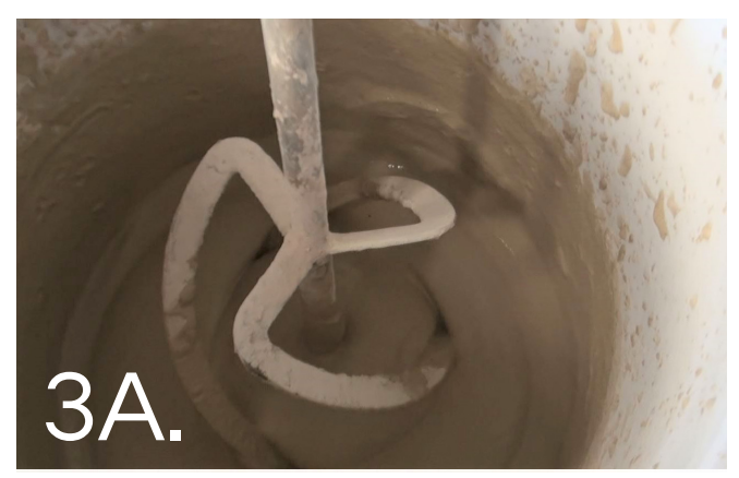
To 3 volumes CemCote stir in thoroughly 1 volume CemBond / water solution (diluted 1 part CemBond with 3 parts water) until a smooth paste is