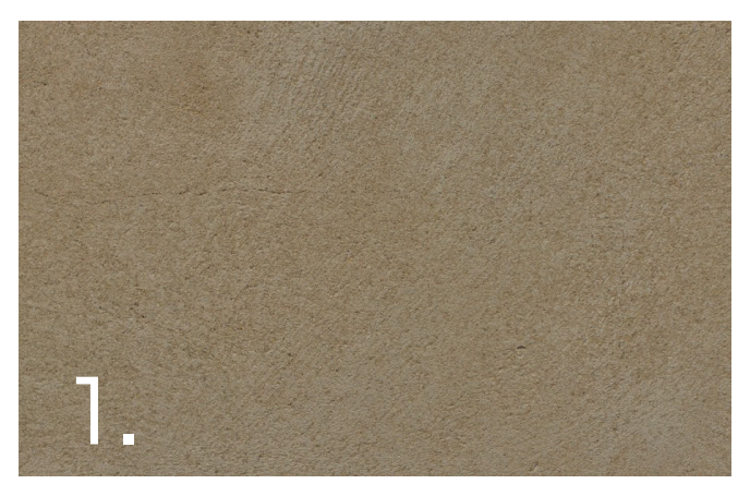
All applicable surfaces to be structurally sound and free from grease, oil, wax, wall paper glue, dust or anything that might interfere with adhesion. Remove dust and loose defective paint if any. Important that the wall is also flat and smooth. New plaster surfaces should have less than 5% moisture content before CemCote application commences.