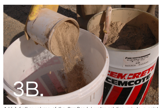
Add 1 further volume of the CemBond / water solution, mix to a paint consistency and apply within 30 minutes.