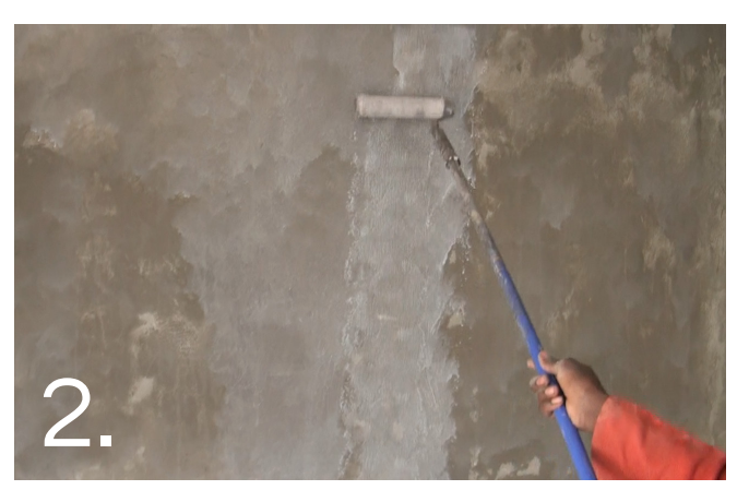
Prime wall prior to application with 2 coats of CemBond / water solution (diluted 1 part CemBond with 3 parts water).