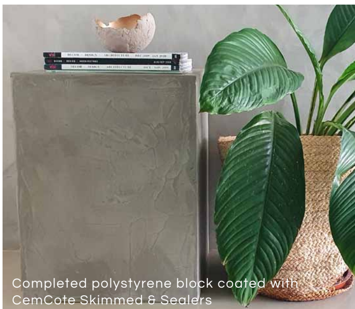
Completed polystyrene block coated with CemCote Skimmed & Sealers