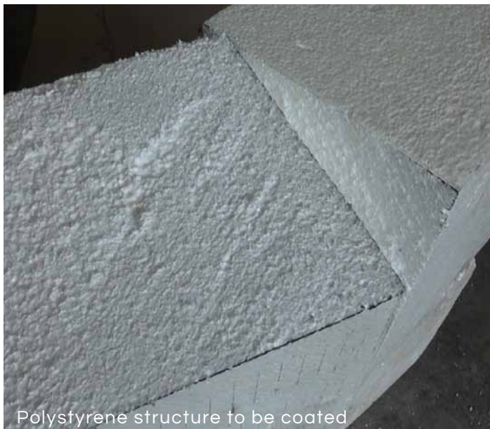
Polystyrene structure to be coated