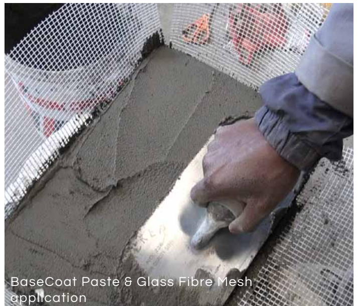
BaseCoat Paste & Glass Fibre Mesh application