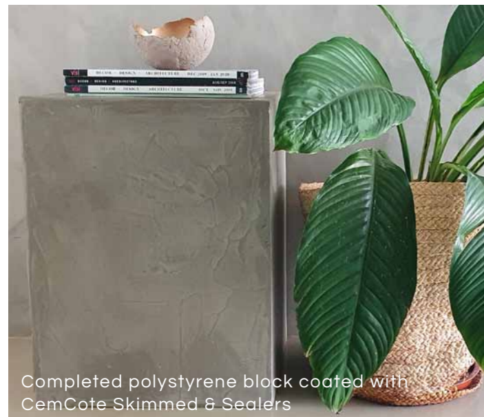
Completed polystyrene block coated with CemCote Skimmed & Sealers