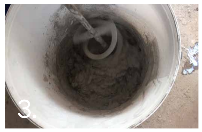
To 1 volume FlexBond / water solution (diluted 1 part FlexBond to 4 parts water), slowly add 3 volumes of CemCote powder and mix mechanically slowly until a workable plaster consistency is achieved. Do not mix manually. NOTE: For exterior use, replace the FlexBond with CreteBond. Dilution ratios stay the same as for FlexBond