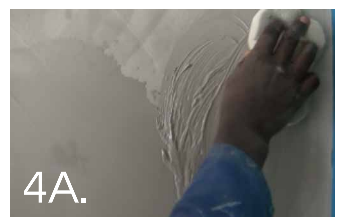
Using a firm sponge rub the first layer thinly onto the surface, follow this method small sections of the wall at a time...

NOTE: For exterior use, replace the FlexBond with CreteBond. Dilution ratios stay the same as for FlexBond.