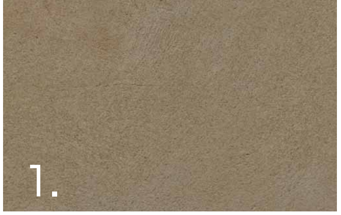
All applicable surfaces to be structurally sound and free from grease, oil, wax, wall paper glue, dust or anything that might interfere with adhesion. Remove dust and loose defective paint if any. Important that the wall is also flat and smooth.