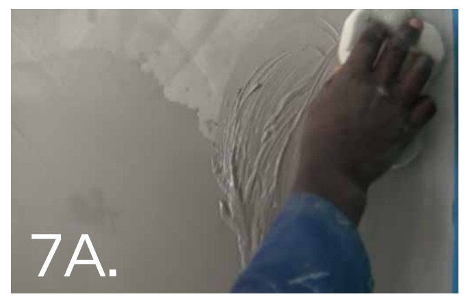
Apply the second coat and any additional coats as needed (max 0.8mm per coat), in the same manner as the first coat, until a smooth finish is achieved. First with a sponge and then...

Remove all dust until the surface is dust free. Clean the surface with a clean damp sponge.