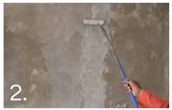
Prime wall prior to application with two coats of Cemcrete's FlexBond/water solution (diluted 1 part FlexBond to 4 parts water). Apply the CemCote the day after primina.

NOTE: For exterior use, replace the FlexBond with CreteBond. Dilution ratios stay the same as for FlexBond.