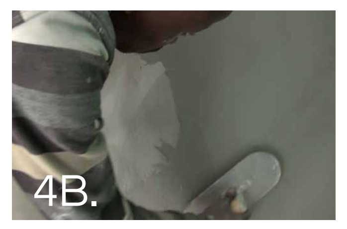
...then while still wet smooth the surface using a rounded pool trowel. Then sponge the next section and repeat the process. Each layer applied must not exceed a depth of 0.8mm even if high spots remain exposed.