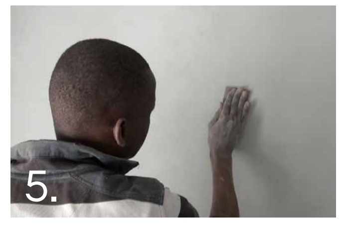
When the first coat of CemCote is dry (but within 24 hours), sand lightly by hand, in a circular motion, with 120 grit Abranet sandpaper. Always use a sanding block when sanding.