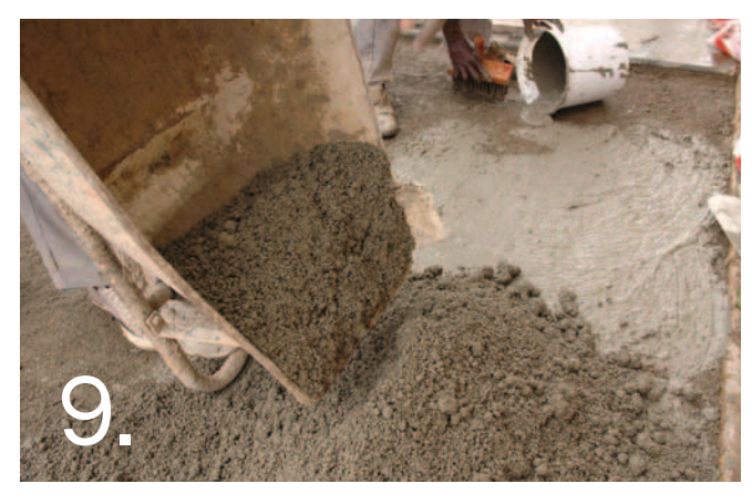
Immediately place screed mix onto wet slurry. Do not allow the slurry to dry (ie: do not apply the slurry too far ahead).