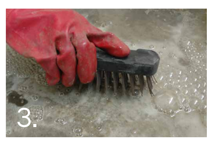
Use this acid solution & a wire brush to clean the surface. Remove all loose material. Neutralize the surface by washing with a solution made up of 1 cup of sodium bicarbonate to 10 litres of water & then rinsed with clean water again.