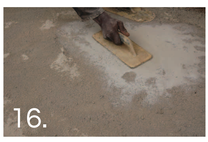
Wood float the Colour Hardener into the surface. If it is necessary to add water; dip the plastic float in a bucket of water; DO NOT use a block brush to flick water onto the screed.