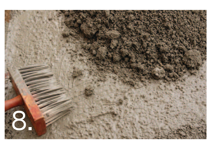
Ensure that the surface is properly covered. The slurry coat will ensure proper bonding between the surface and the screed.