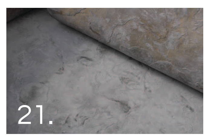
Remove the imprint mat carefully. Always fold the imprinting mat to the point of least resistance / suction.