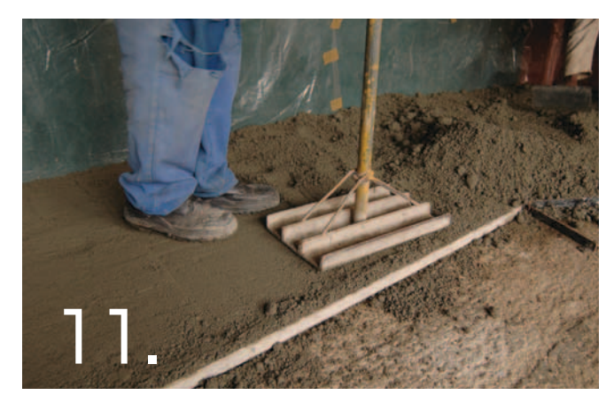
Spread screed mix evenly and compact thoroughly. Do not compact screed that is too thick in one go; compact in multiple stages depending on the thickness of the screed.