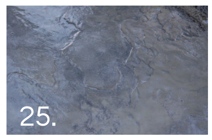
Cure by wetting with clean water 3 times daily for 5 days.