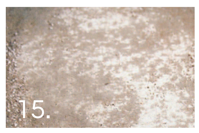
Leave Colour Hardener to soak up the water from the screed.