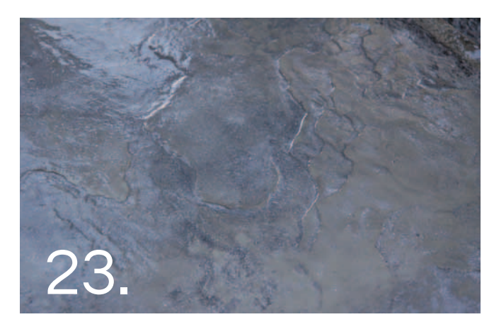
Leave to dry for 3 days.