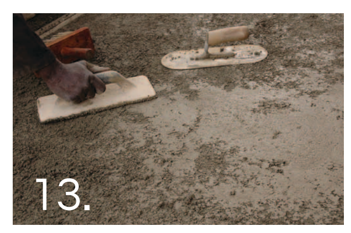
Wood float screed. If additional water is required, wet the plastic float only; do not spray the screed directly with water.