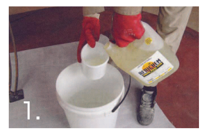
Combine 1 volume hydrochloric acid...