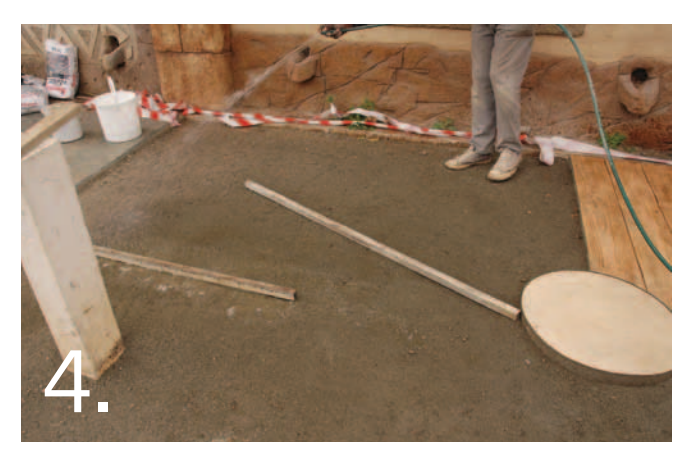
Rinse thoroughly. Surface must be damp prior to application.