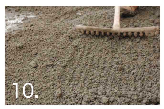
Spread screed mix evenly.