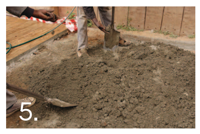
Combine 4 volumes of crusher dust or good clean river sand...