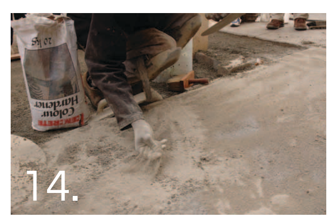
Apply Colour Hardener at the rate of 2kg / m<sup>2</sup>.