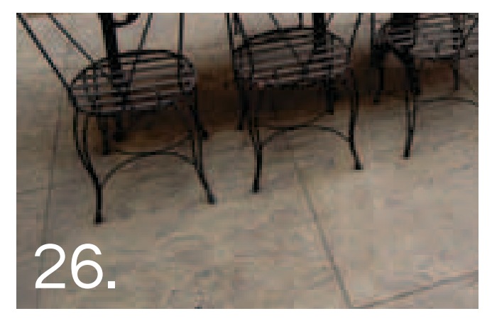
Leave to dry for a minimum of 7 days. Moisture level should be below 5% prior to sealing.