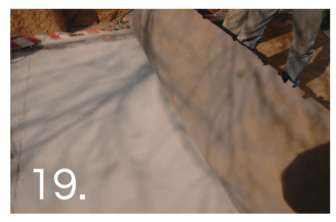
Place the mat carefully and ease onto the surface.