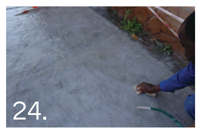
Wash surface carefully to remove excess Coloured Release Agent.