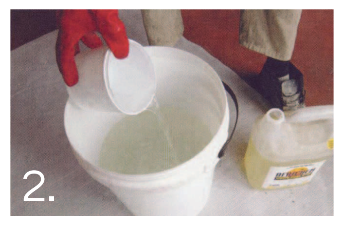
... and 3 volumes water.