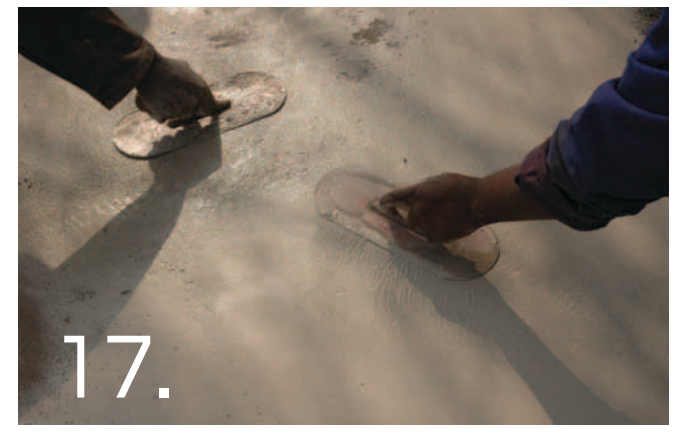
Apply a second dusting of Colour Hardener at a rate of 3kg/ m². Allow to soak in the moisture from the screed, then plastic float and steel trowel.