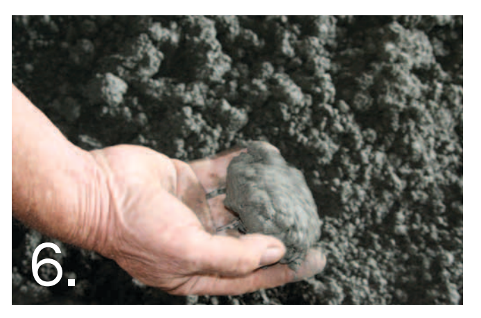
... with 1 volume of 42.5 cement. Mix dry and then add water to obtain a stiff consistency.