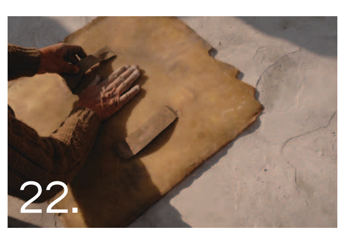
Use a small imprint mat to print corners or curves.