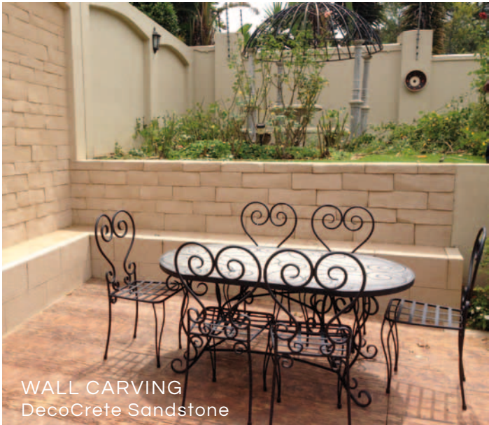
WALL CARVING DecoCrete Sandstone