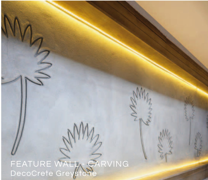
FEATURE WALL - CARVING DecoCrete Greystone

Approximately 1m² if applied 10mm thick.