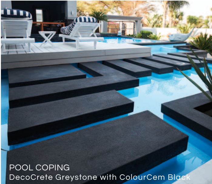
POOL COPING DecoCrete Greystone with ColourCem Black