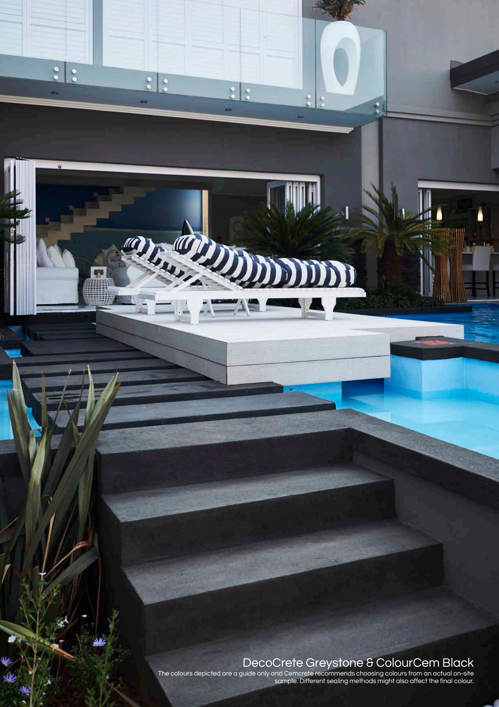
DecoCrete Greystone & ColourCem Black

The colours depicted are a guide only and Cemcrete recommends choosing colours from an actual on-site sample. Different sealing methods might also affect the final colour.