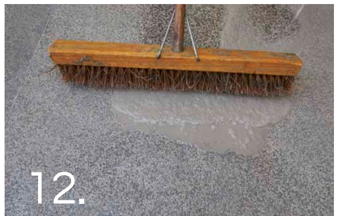
12. The area should be washed using a portable high-pressure water washer with a wide slit nozzle and assisted with a nylon brush or broom. This will assist in the exposure of the decorative stones. Consult the data sheet for further details, as well as curing and sealing instructions.