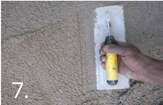
7. Apply the mixed Exposed Aggregate to a thickness of 8mm with a suitable steel trowel onto the tacky Concrete Primer to ensure a proper bond between layers.