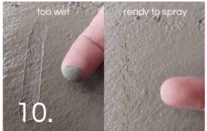
10. Leave the floor covered with plastic for at least 2 days in summer and 3 to 4 days in winter. In cold weather this may take longer. Use these photos as a reference guide.