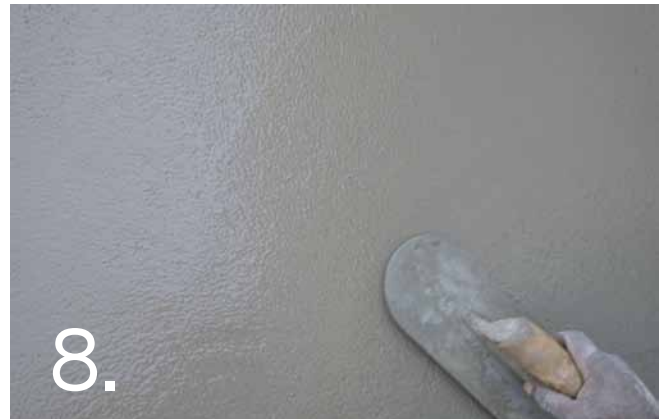
8. Ensure the Exposed Aggregate is floated level with the guide strips using a straight edge and then steel floated smooth. Only mix enough material to cover each panel floated flush to the guide strips.