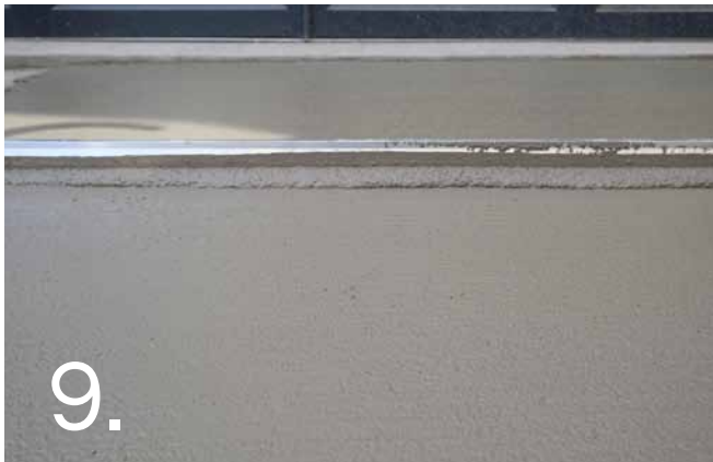
9. Avoid dry joints by completing the application to the entire control joint panel in a continuous operation. Repeat entire process for each panel. Note: No panels should be left partially filled as cracks will appear when the new Exposed Aggregate is applied at a later stage.