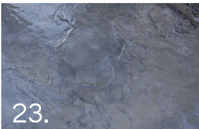
Leave to dry for 3 days.