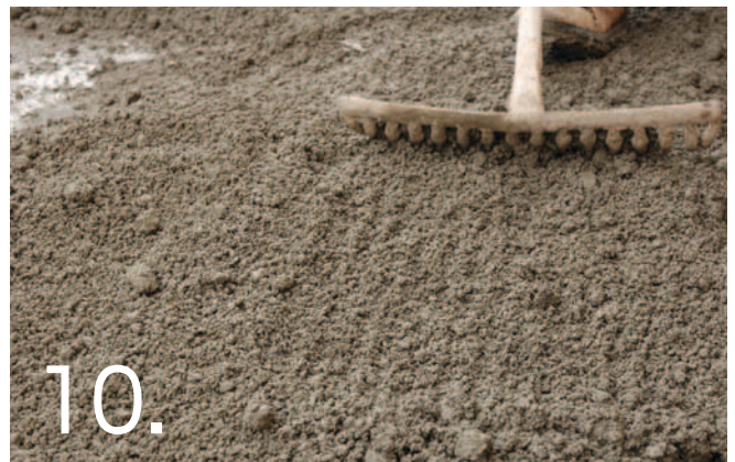
10. Spread screed mix evenly.