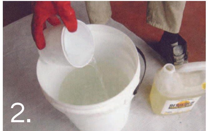
2. ... and 3 volumes water.