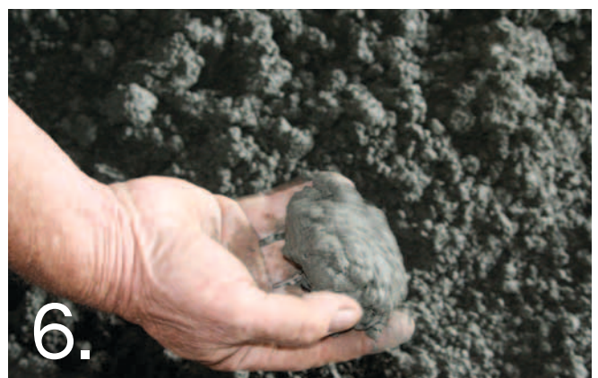
6. ... with 1 volume of 42.5 cement. Mix dry and then add water to obtain a stiff consistency.