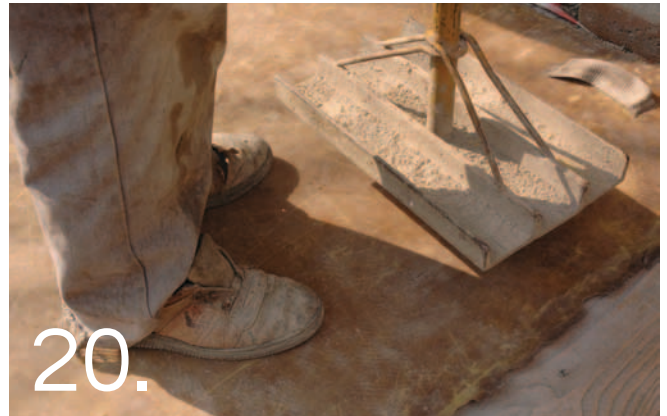
Stamp the imprint mat to transfer the design onto the surface.