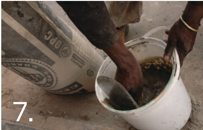
7. Mix 1 volume of FlexBond with 2 volumes of water. Use this liquid to mix 3 parts PrimerCote powder to 2 parts FlexBond solution to a creamy slurry.