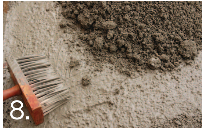
8. Ensure that the surface is properly covered. The slurry coat will ensure proper bonding between the surface and the screed.