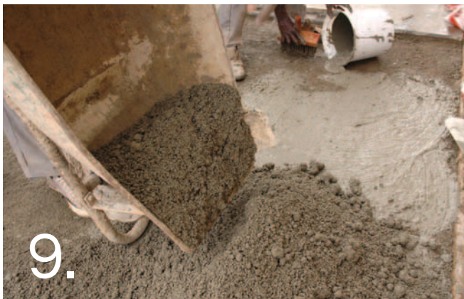
9. Immediately place screed mix onto wet slurry. Do not allow the slurry to dry (ie: do not apply the slurry too far ahead).