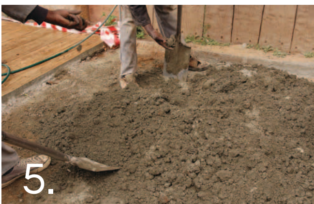
5. Combine 4 volumes of crusher dust or good clean river sand...