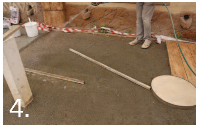
4. Rinse thoroughly. Surface must be damp prior to application.