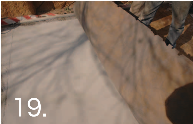
Place the mat carefully and ease onto the surface.