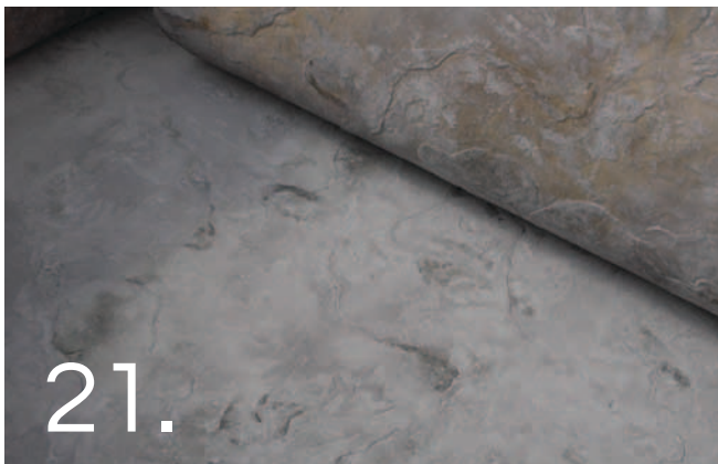
Remove the imprint mat carefully.