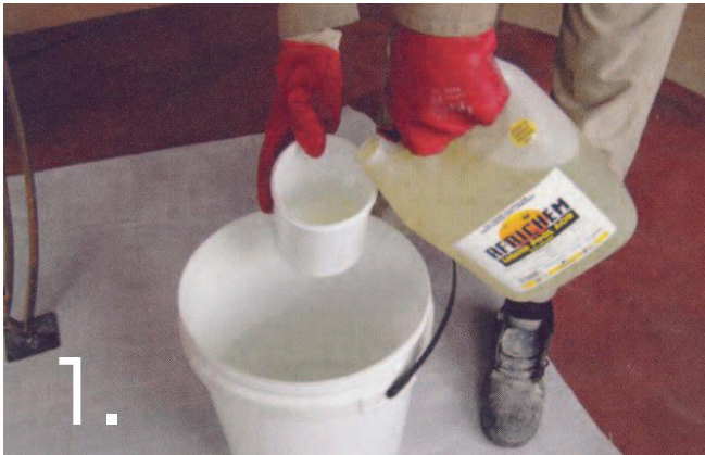
1. Combine 1 volume hydrochloric acid...