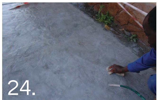
Wash surface carefully to remove excess Coloured Release Agent.