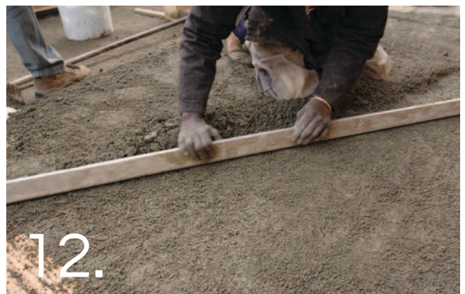
12. Strike level. Add extra screed mix to fill indentations.