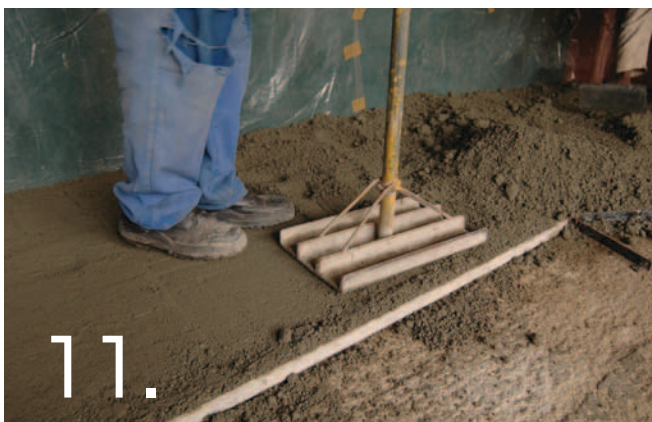
11. Compact thoroughly.