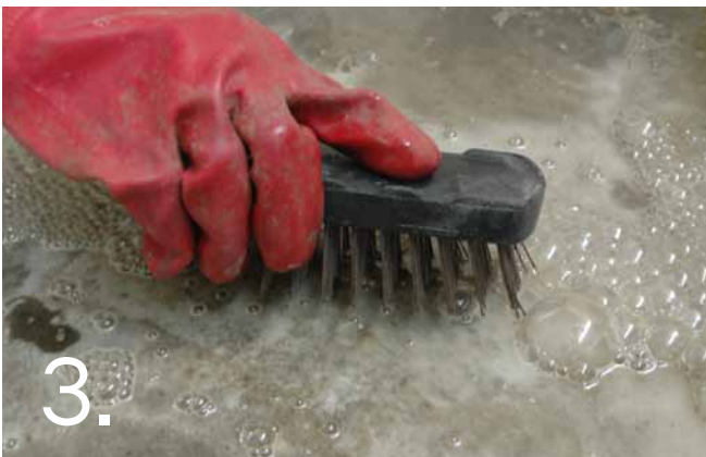
3. Use this acid solution & a wire brush to clean the surface. Remove all loose material. Neutralize the surface by washing with a solution made up of 1 cup of sodium bicarbonate to 10 litres of water & then rinsed with clean water again.