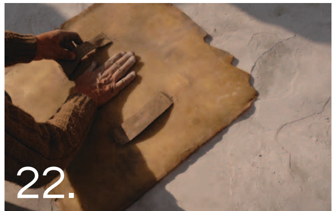
Use a small imprint mat to print corners or curves.