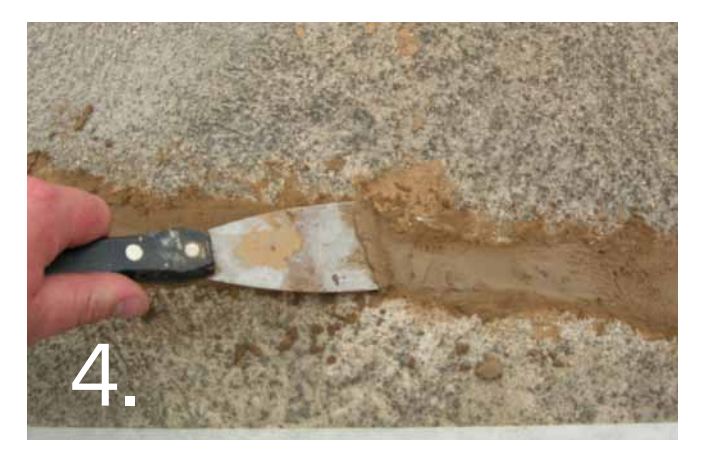
Mix 3 volumes of MatCrete and 1 volume mixing liquid to form a MatCrete paste. Prime the crack with the diluted FlexBond solution, and, when tacky, apply the MatCrete paste to fill the cracks. Leave to dry.