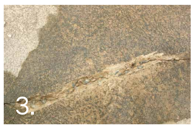
Open cracks at least 10mm x 10mm. Acid wash, wire brush and rinse. Neutralize the surface by washing with a solution made up of 1 cup of sodium bicarbonate to 10 litres of water, and then rinse with clean water again.