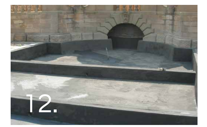
Leave to air cure for 3 to 4 days.