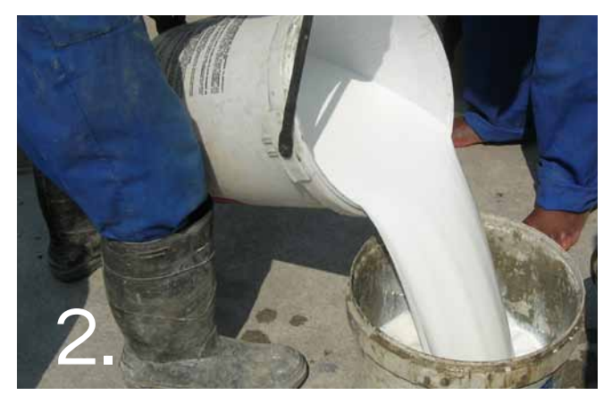
Prepare a mixture consisting of 1:5 volumes of FlexBond to water. This will be used as the mixing liquid.

Combine 1 volume hydrochloric acid and 3 volumes water. Apply to the unpainted surface and leave to react for 15 minutes. Wire brush and rinse thoroughly. Neutralize the surface by washing with a solution made up of 1 cup of sodium bicarbonate to 10 litres of water, and then rinse with clean water again.