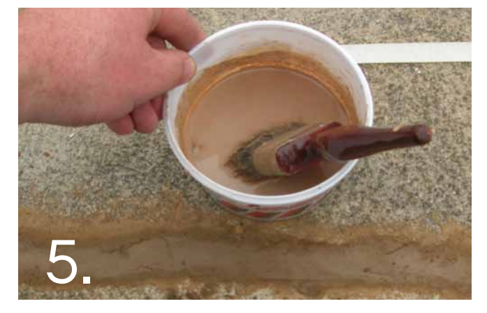
Prepare a slurry consisting of MatCrete and the mixing liquid. Paint over the repaired crack.