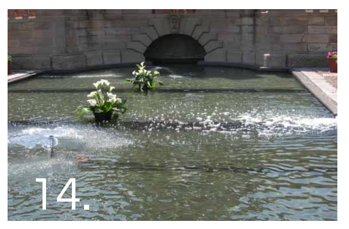
Water should be tested after 7 days and treated if necessary before introducing plants and fish.