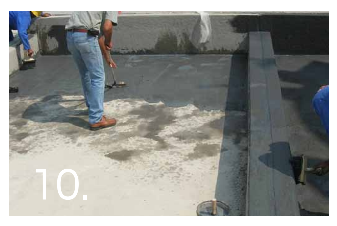
Soft brooms may be used to apply the MatCrete for larger areas.

Apply first coat of MatCrete evenly over the entire structure using a blockbrush. Place a layer of CemForce over the wet MatCrete, making sure to overlap each joining piece by at least 10cm.