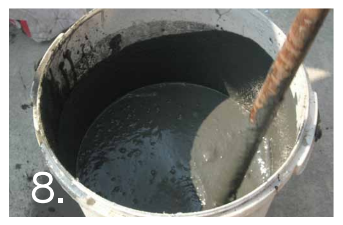
Note the consistency of the mix.

Mix MatCrete with enough mixing liquid to obtain a paintable consistency.