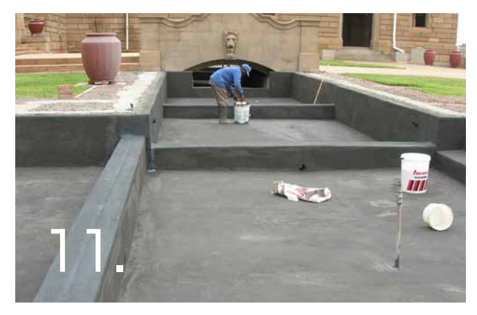
Apply a second coat of MatCrete once the first coat has set. This must be done on the same day. A second layer of CemForce may be applied if required. This second layer should be placed perpendicular to the first layer. Follow with a final coat of MatCrete.