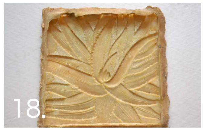
Once removed, you may cast your mould with various materials including Cemcrete's TexCrete.