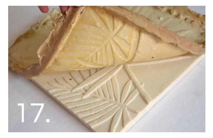
Once set, slowly start at the corners and pull the mould away from the panel.