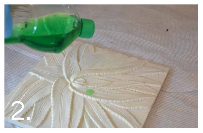
Use a sparing amount of washing liquid to act as a release agent.