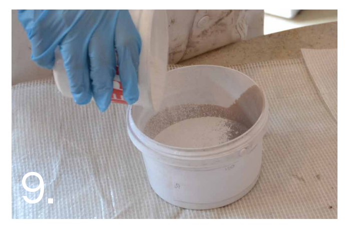
Add enough thickening agent to make a paste.

Pour some Mould Rubber into a tub. The amount is determined by the size of the panel / object.