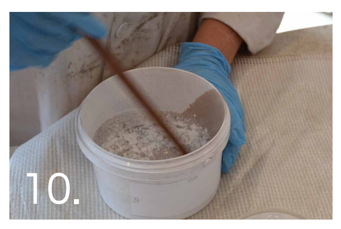
Mix together. At this point you will know weather to add more thickening agent to the mix.