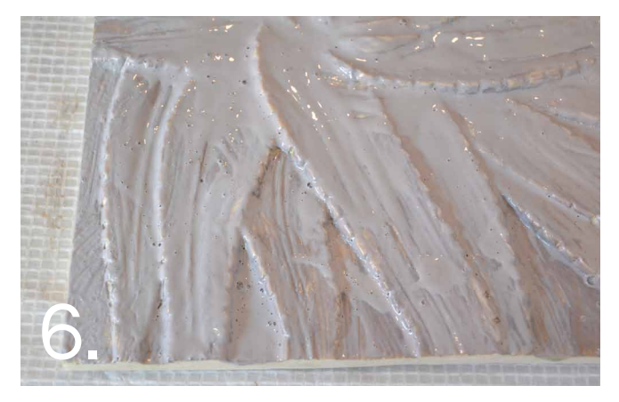
Pop any bubbles you see. Wait for it to dry before applying a second layer. Use a fan to speed up the process if required.