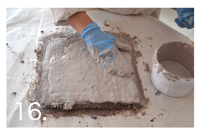
Spread evenly. Leave the finished mould to dry overnight. It should be completely set before you remove it from the panel.