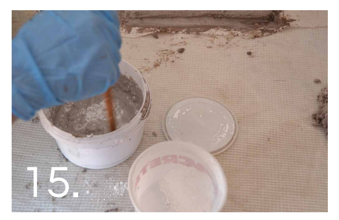
Once dry, mix another batch of the Mould Rubber and thickener.