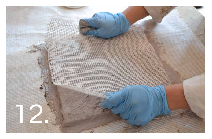
While still wet, place a layer of CemForce over the panel.