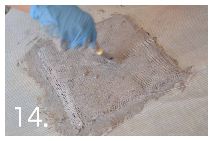
You may add additional Mould Rubber to ensure the CemForce is saturated.