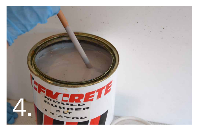
Thoroughly mix the Mould Rubber before use.