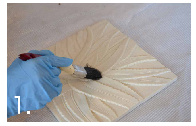
Use a brush to remove all dust particles.