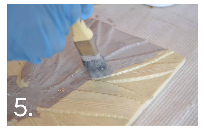
Use a brush to spread a thin coat of Mould Rubber over the panel so that it may pick up fine detail. Apply the Mould Rubber at thicknesses of around 3 - 4mm at a time.