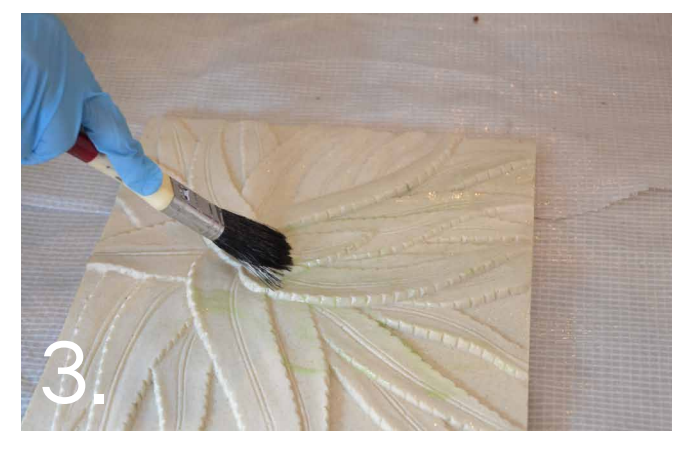
Spread the release agent thinly and wait for it to dry.