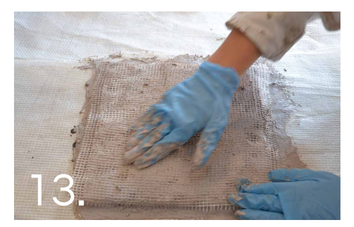
Use a trowel or your hands to embed the CemForce into the surface.