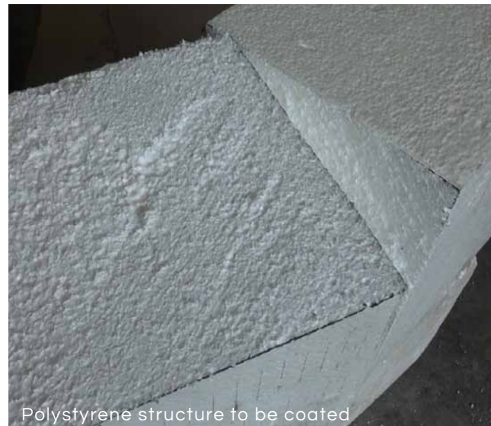
Polystyrene structure to be coated