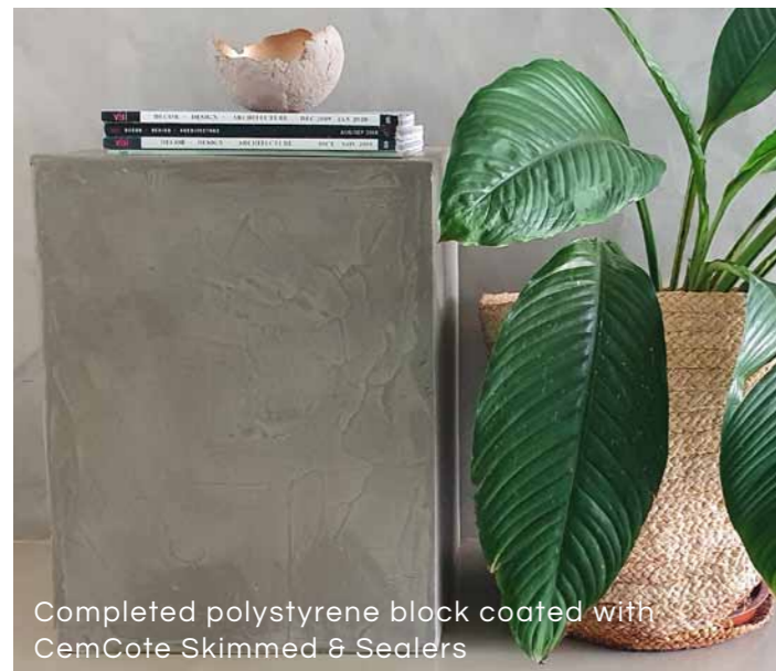
Completed polystyrene block coated with CemCote Skimmed & Sealers