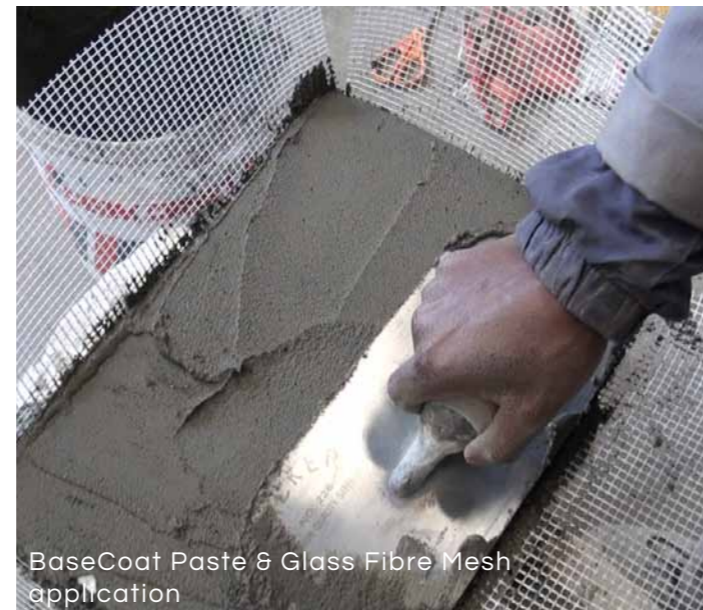
BaseCoat Paste & Glass Fibre Mesh application