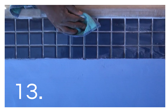
Clean all mosaics, tiles and surrounds.