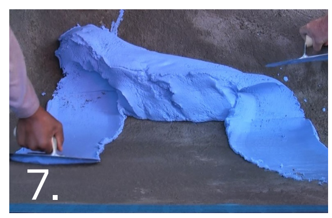
Apply PoolCrete 6mm thick with flexible rounded steel trowels. Apply the first layer, forcing the material tightly against the surface. The first layer is followed immediately by a second trowel with more material to an application not exceeding 6mm. It is easier to plaster the walls first 8 continue onto the floor.