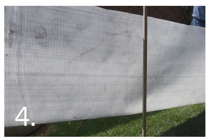
Set up sun and wind barriers prior to the application of PoolCrete to avoid premature moisture loss and plaster shrinkage.