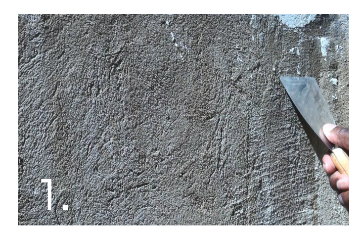
Gunite, hand-packed concrete or scratch coat cement plaster that has cured for 28 days. Must not contain blast furnace slag as this could cause mottling of the PoolCrete. All surfaces should be true in plane, hard and slightly rough (i.e. scratch plaster type finish) to form a mechanical key.