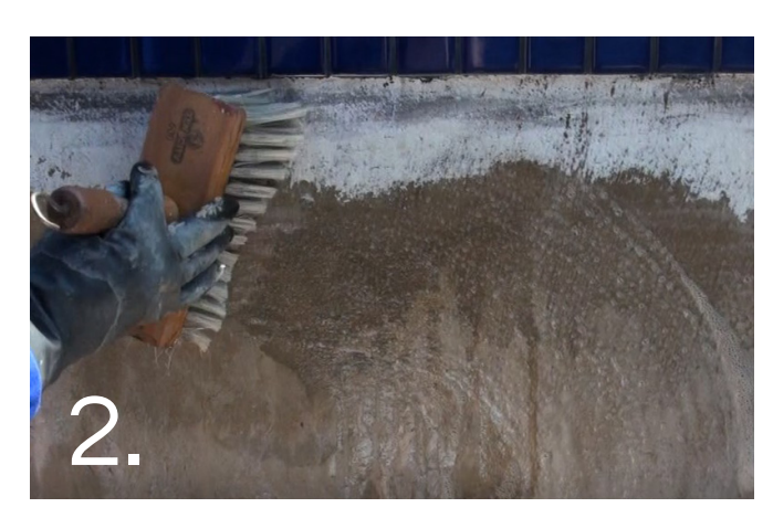
Dirty surfaces, particularly on the floor, should be pre-dampened and then acid-washed and vigorously brushed and flushed with plenty of clean water. To ensure the neutralization of the surface we recommend that the surface is washed with a solution made up of 1 cup of sodium bicarbonate to 5 litres of water and then rinsed with clean water again.