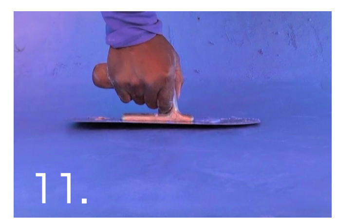
Allow to stiffen for approximately 30 min, depending on the weather, & retrowel to smooth out ridges & trowel marks. Avoid splattering additional water onto the PoolCrete surface as this will result in colour variation.