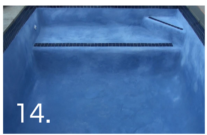
Filling of the pool can commence \pm 6 to 8 hours after plastering has been completed depending on ambient temperatures & relative humidity where plastering has been completed early afternoon. Where this is not the case \boldsymbol{\vartheta} the plastering is completed late afternoon or early evening it is recommended that the filling process commences the morning following the application.