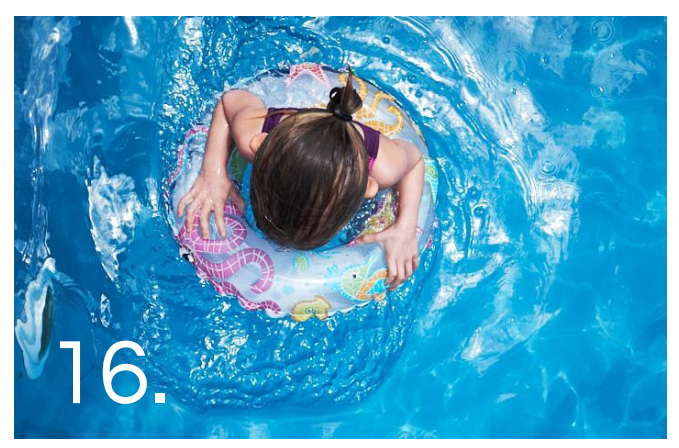
Do not introduce an automatic cleaner to the pool for 3 weeks. During this period use the pool brush only. See the detailed PoolCrete Start-Up Guide available on www.cemcrete.co.za.