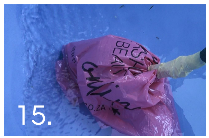
Commence filling the pool from the deep end. We recommend the use of a deflector on the end of the hosepipe to prevent damage to the surface. Fill the pool in one go to avoid a water ring from forming. Damp down the exposed PoolCrete every hour to prevent premature drying. Protect the plaster from staining (particularly from mud splashes) until the pool is filled.