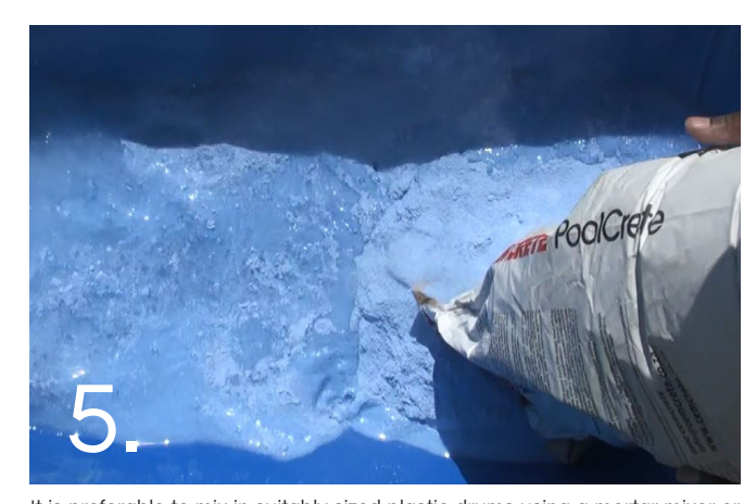
It is preferable to mix in suitably sized plastic drums using a mortar mixer or hand mixed on a board or tarpaulin outside the pool. Mixing inside the pool increases the risk of plaster discolouration, separation or debonding as a result of mix water saturating the substrate prior to plastering.