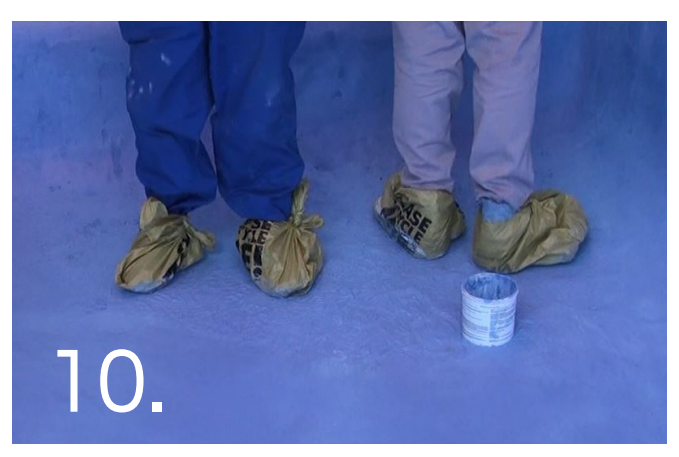
When almost set, final trowelling should take place. Wear bags around shoes to avoid leaving shoe prints in the plaster.