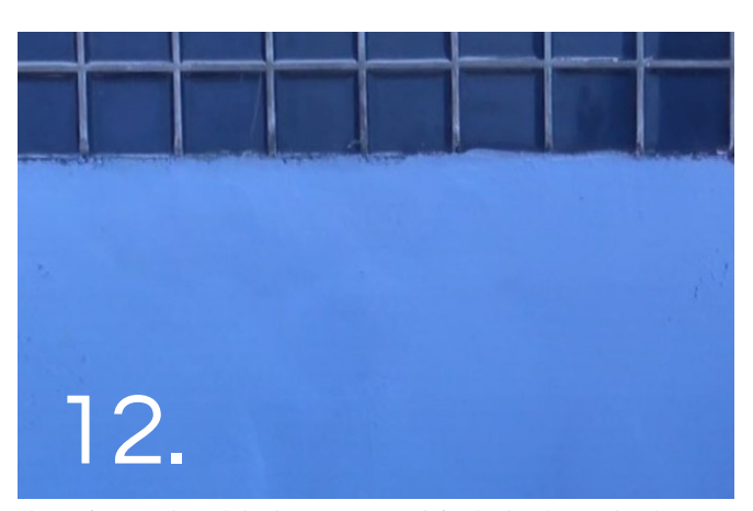
The surface can be polished to a very smooth finish when biscuit-hard. Always complete plastering in one day to avoid dry joints.