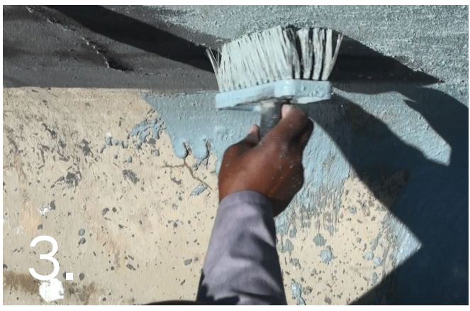
It is recommended for new or old pools to be slushed with FlexBond and PoolCrete Primer the day before application, to help restrict slagment stains coming through the plaster as well as ghosting.